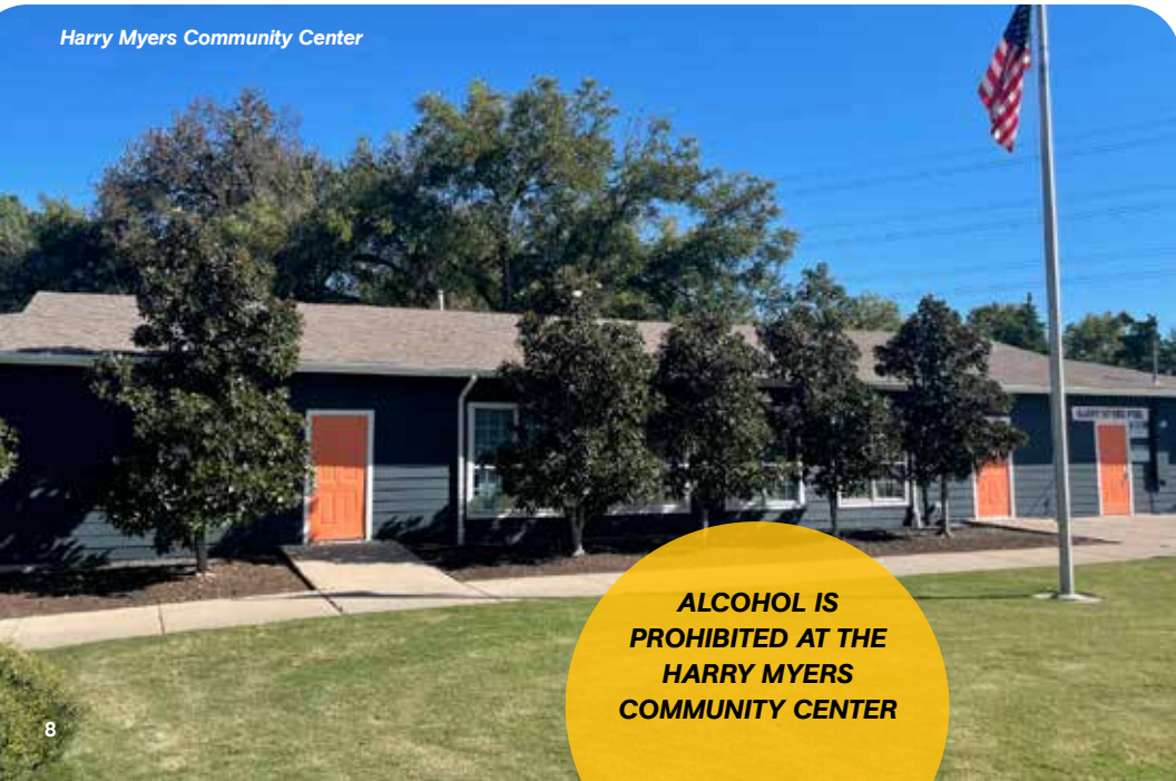
Harry Myers Community Center

ALCOHOL IS PROHIBITED AT THE HARRY MYERS COMMUNITY CENTER